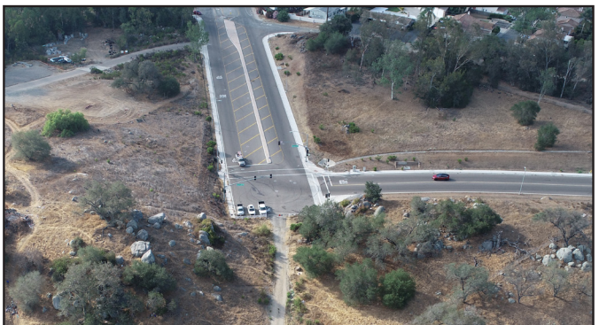
Citracado Parkway, Current Configuration South End at Harmony Grove Village Parkway