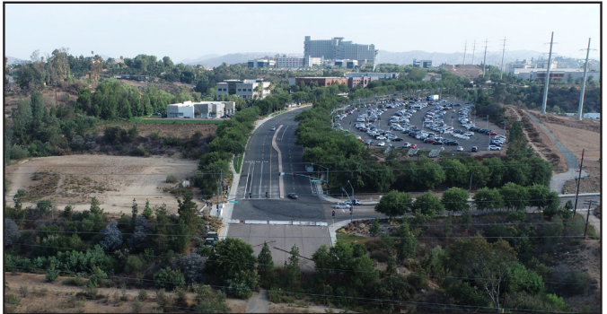
Citracado Parkway, Current Configuration North End at Andreesen Drive

Citracado Parkway, between West Valley Parkway to Andreesen Drive.